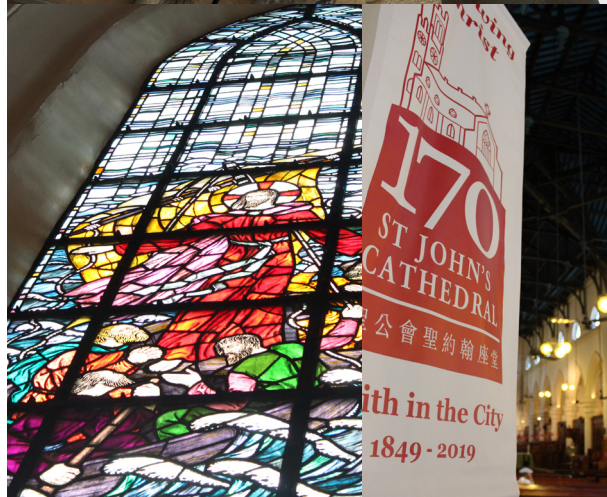
St John's Cathedral Michaelmas Fair 2019 Presents